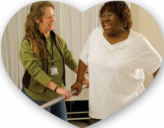
National Multiple Sclerosis Society, Upstate New York Chapter