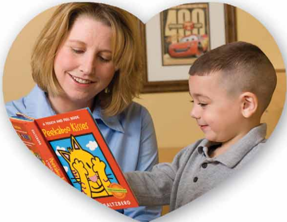
Rochester Hearing and Speech Center