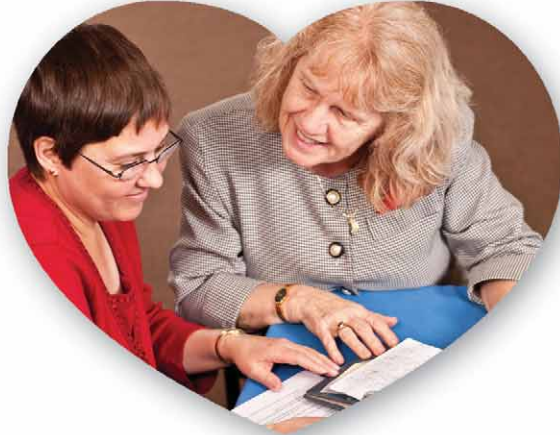
Epilepsy Foundation of Rochester-Syracuse-Binghamton