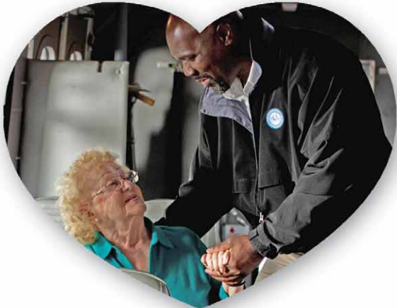
Medical Motor Service