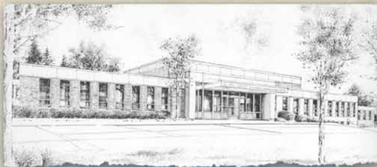
Golisano Building, Elmwood Campus