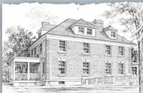
Schwartz Family Campus