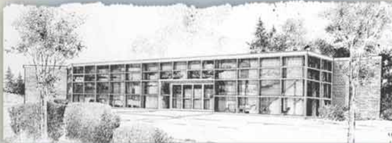
Hale Building, Winton Campus